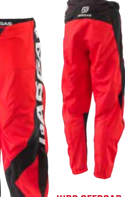
KIDS OFFROAD PANTS

Perfectly matching our Kids Offroad Shirt, these pants are lightweight and packed with the latest tech to guarantee style, fit, and function.